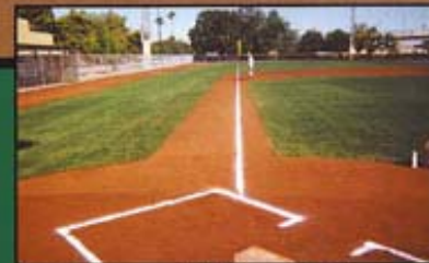
Randy Johnson Field, Phoenix AZ Hilltopper® Infield