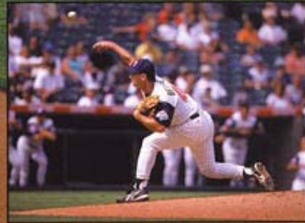
Edison Field, Anaheim Angels Hilltopper® Mound & Homeplate Area