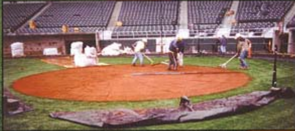
P.G.E. Park, Portland Beavers Hilltopper® Mound & Infield