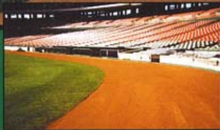
Busch Stadium, St. Louis Cardinals Hilltopper® Warning Track