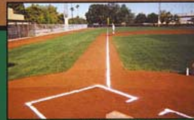
Randy Johnson Field, Phoenix AZ Hilltopper® Infield