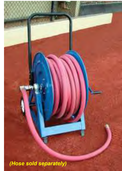
(Hose sold separately)