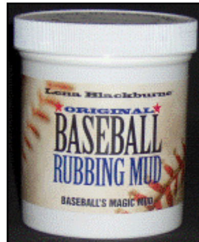
The Original Baseball Rubbing Mud! Used By All Major League Teams!

DRI-BALL® Within 30 seconds turn any water-soaked ball into a perfectly dry ball! DRI-BALL® is quick and easy to use for games and practice! For baseball, softball, football, soccer, tennis, volleyball or any other sport with a ball that gets damp, wet or even soaking wet!