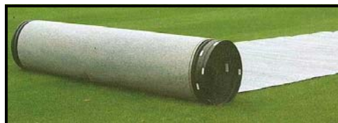
Rollers for easy handling and storage, see Rain Covers Catalog .