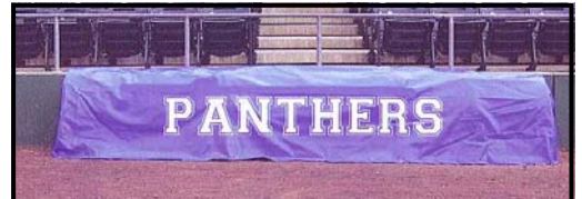
Roller covers for extra protection, see Rain Covers Catalog .

WARNING: SPECIAL CARE MUST BE TAKEN TO BE SURE SPIKES DO NOT COME LOOSE OR TO NOT LEAVE ANY SPIKES ON THE FIELD, WHICH WOULD BE A DANGEROUS HAZARD.